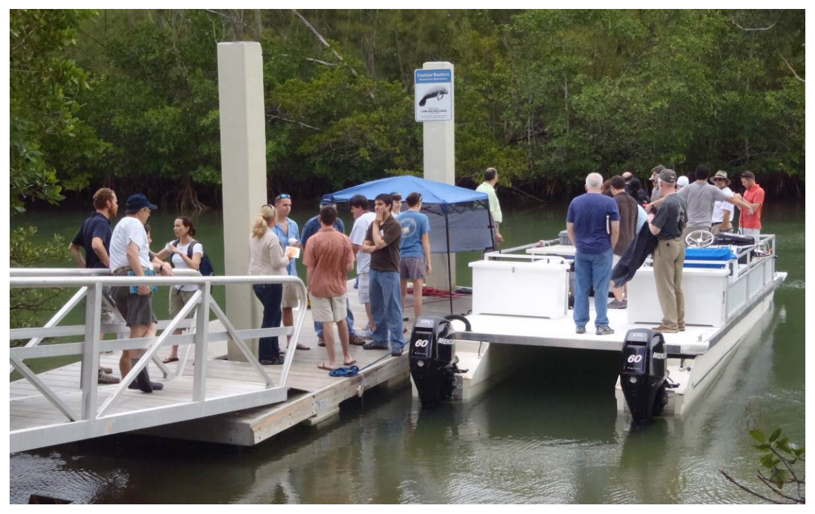
Workshop participants gather on the FIU research dock and research vessel.