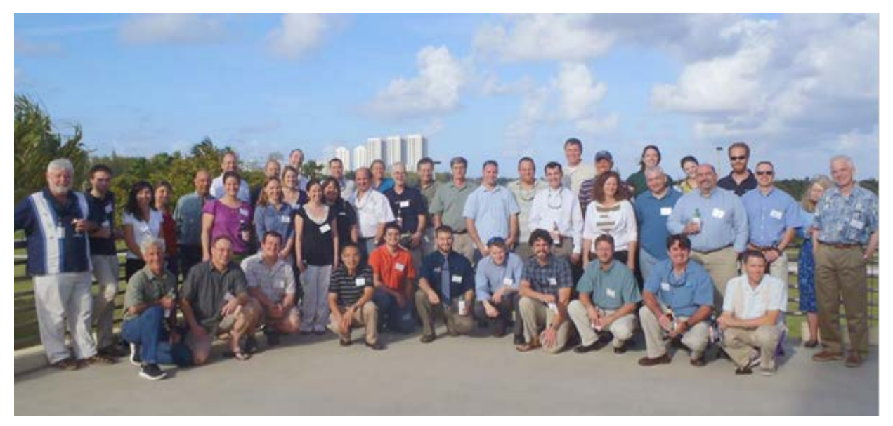
Participants of the 2012 SEAC Workshop held in Miami, Florida 13-15 March 2012.