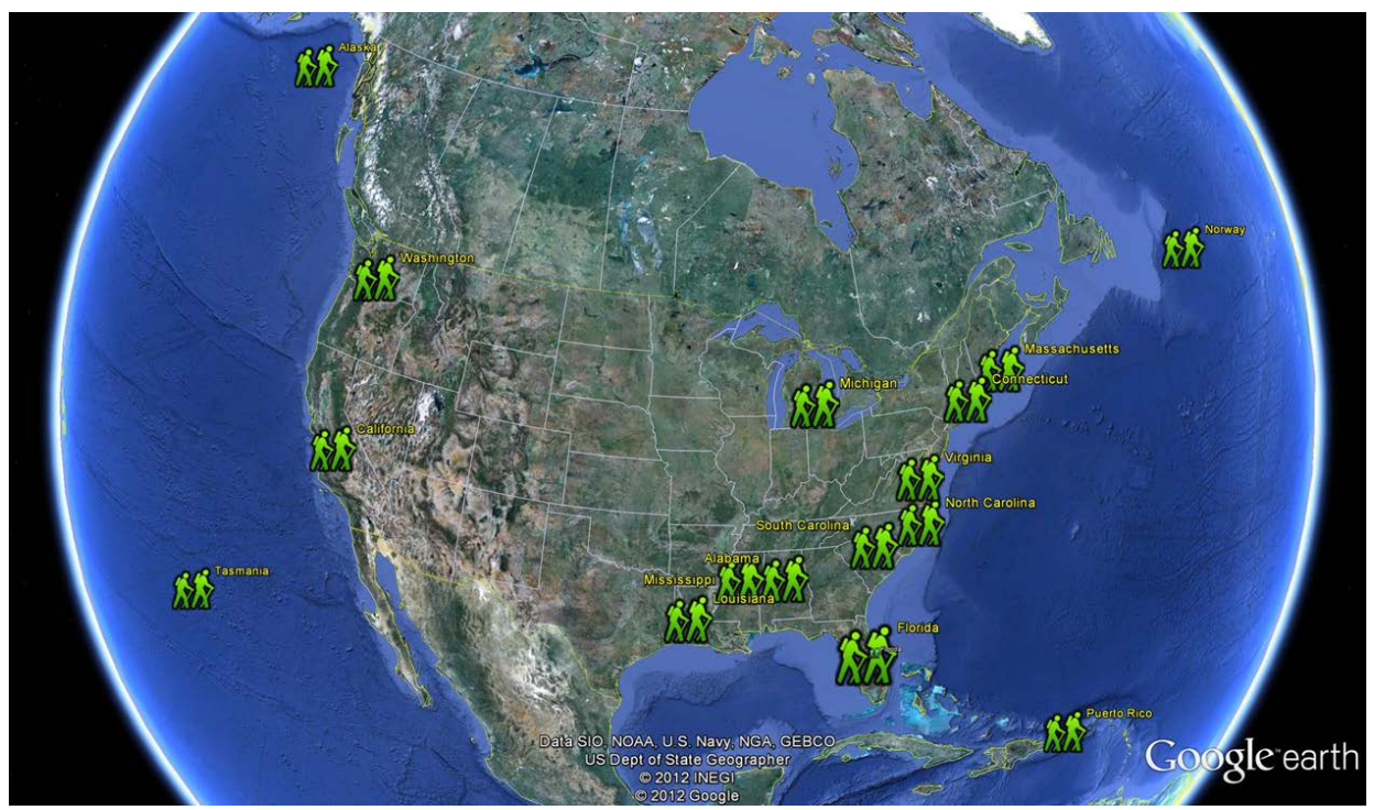
Participants traveled from Alabama, Alaska, California, Connecticut, Florida, Louisiana, Massachusetts, Michigan, Mississippi, North Carolina, South Carolina, Virginia, Washington, Puerto Rico, Tasmania-Australia and Norway.