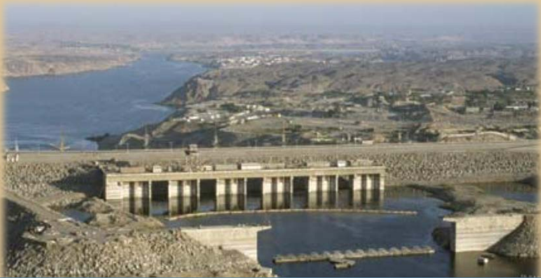
The Aswan High Dam, Aswān, Egypt.